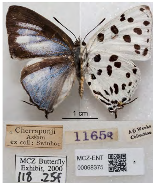
Image 1. Tajuria maculata : male specimen taken at Cherrapunji, eastern Meghalaya, northeastern India. Left shows the upper side, right shows the underside of the same specimen (Photographs: Krushnamegh Kunte; © President and Fellows of Harvard College).