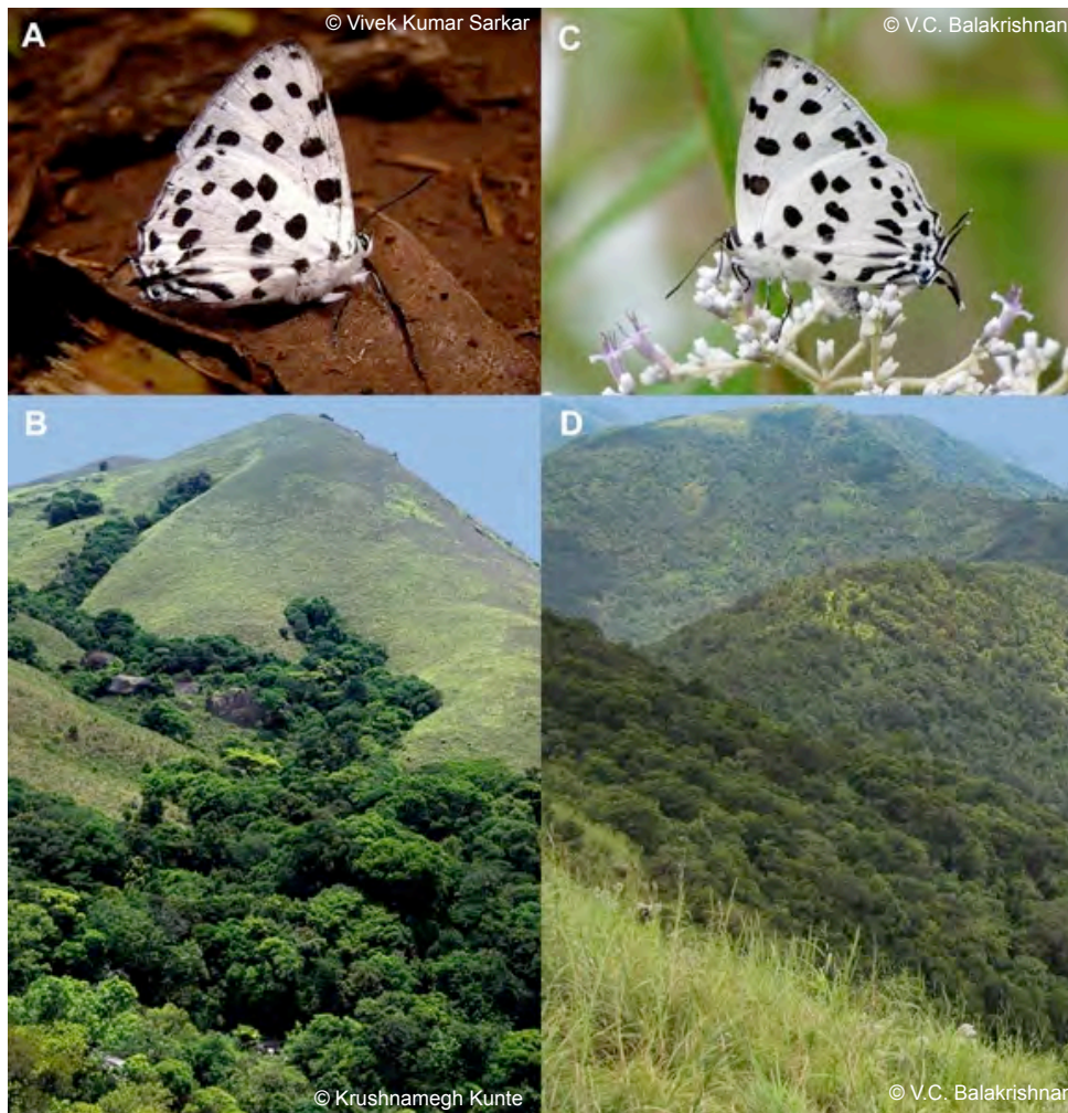
Image 2. Tajuria maculata in the Western Ghats. A - 19.xi.2009, mudpuddling, in the Brahmagiri Wildlife Sanctuary; B - Habitat at the Brahmagiri, on way to Narimalai Guest House; C - 02.x.2010, feeding from flowers of Knoxia sumatrensis at Kottathalachimala; D - Habitat at Kottathalachimala

(Image 2A) from 1100 to 1130 hr near the Iruppu Falls, a popular tourist destination (approximately 300–500 m, 11°57.8'N & 75°58.5E). The other three were seen feeding on white flowers of an unidentified straggling vine in a shola forest patch near the Narimalai Guest House, at 1,300m. These individuals were feeding well above the ground, constantly chasing each other, and could not be photographed.